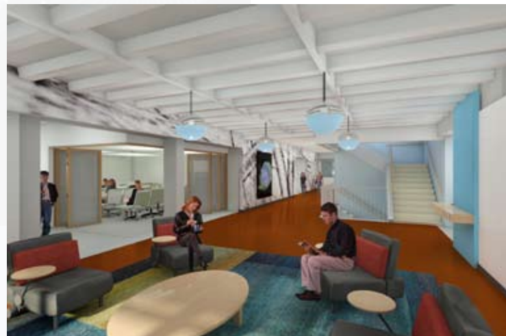
View of the Lobby/Lounge